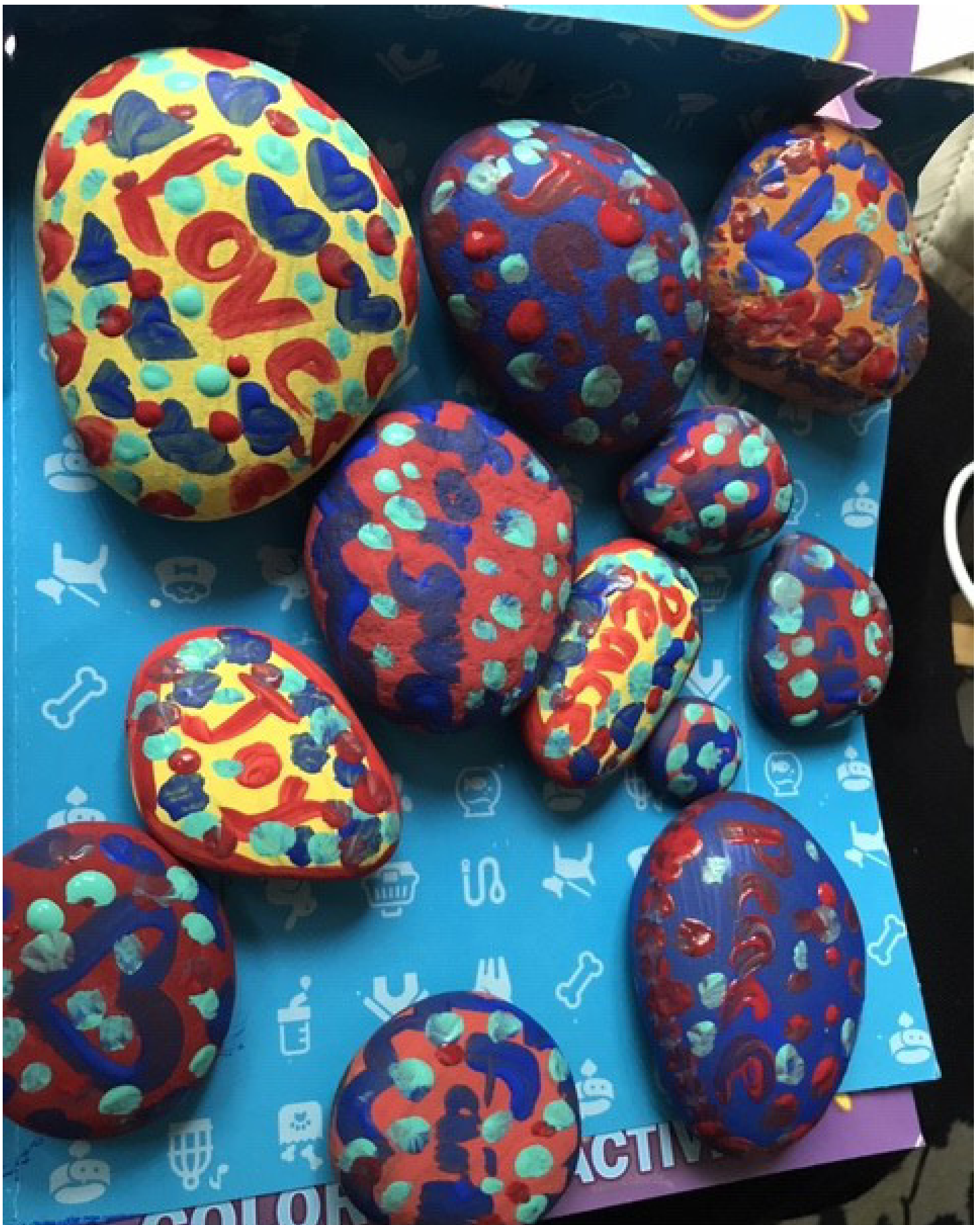
A photograph of 12 different brightly coloured rocks that are painted with polka-dots on the rocks are the words; “peace”, “love”, “joy”, “Jesus”, “faith” and “forgave” on a blue plate.